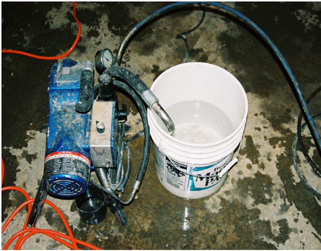
Figure 13. Always flush lines thoroughly.