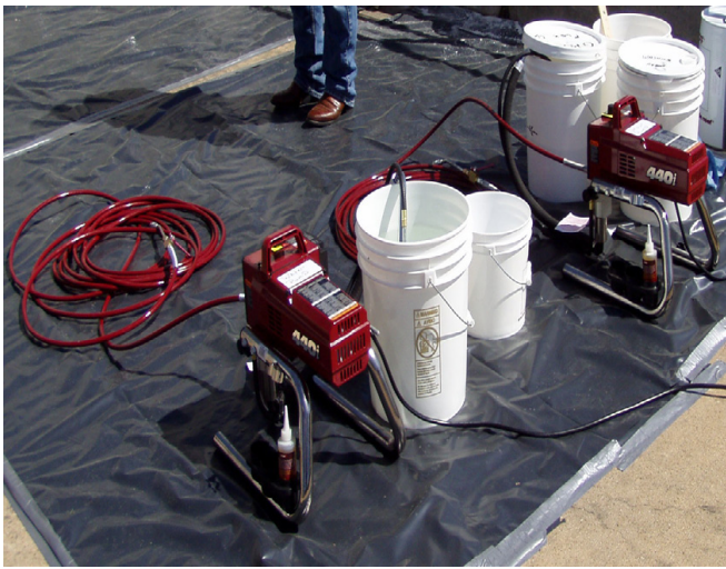
Figure 7. Two pumps: one for water and one for grout.