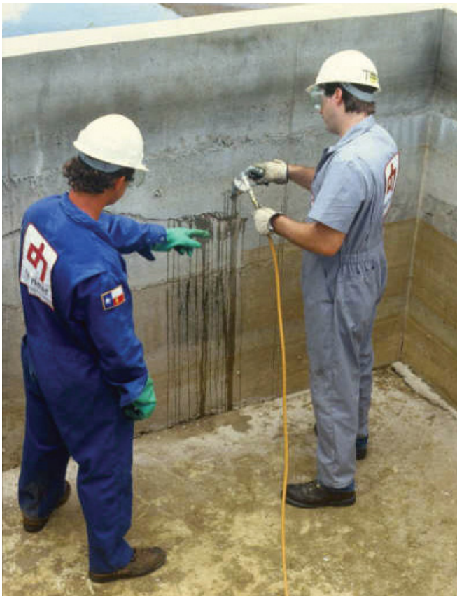
Figure 8. Flushing crack with water.