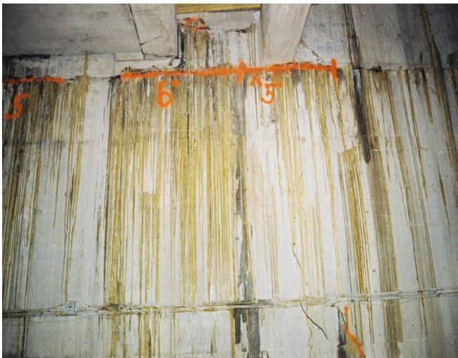
Figure 10. Port-to-port continuity.