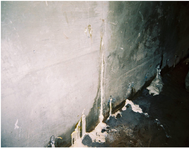
Figure 9. Grout travel up vertical crack.