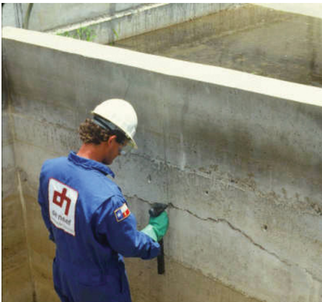
Figure 1. Preparing the crack..