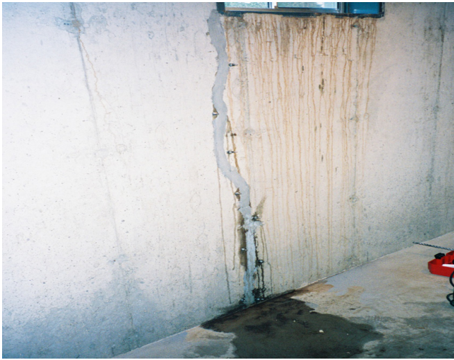
Figure 3. The lines show the port spacing. Closer at the bottom where the crack is tighter, further apart at the top where the crack widens.