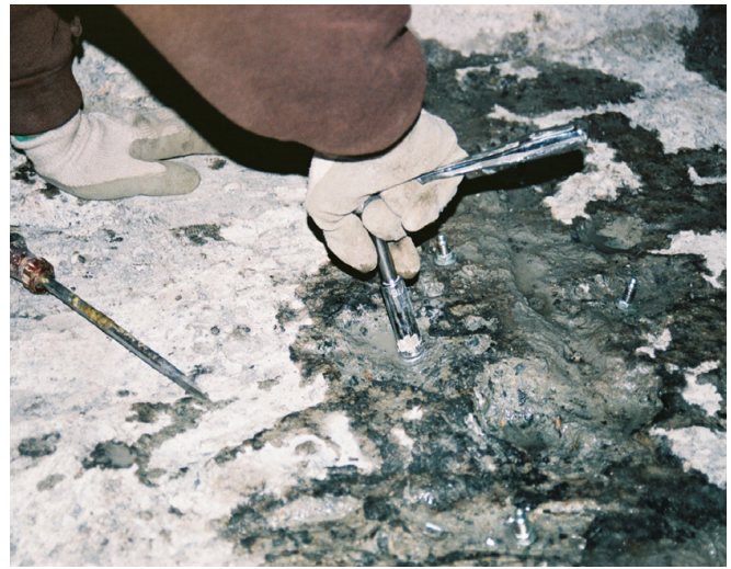
Figure 5. Installation of packers