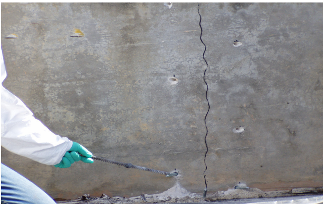
Figure 4. Drill hole pattern.