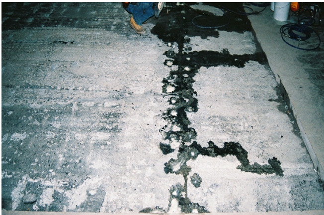
Figure 11. Port to port grout show