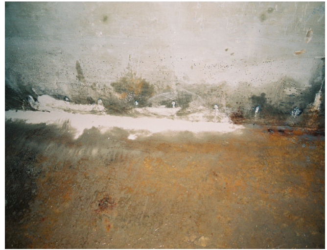
Figure 12. Dry, grouted joint.