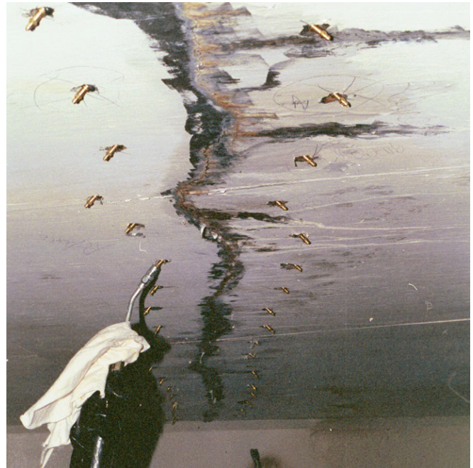
Figure 6. Drill pattern on overhead crack.